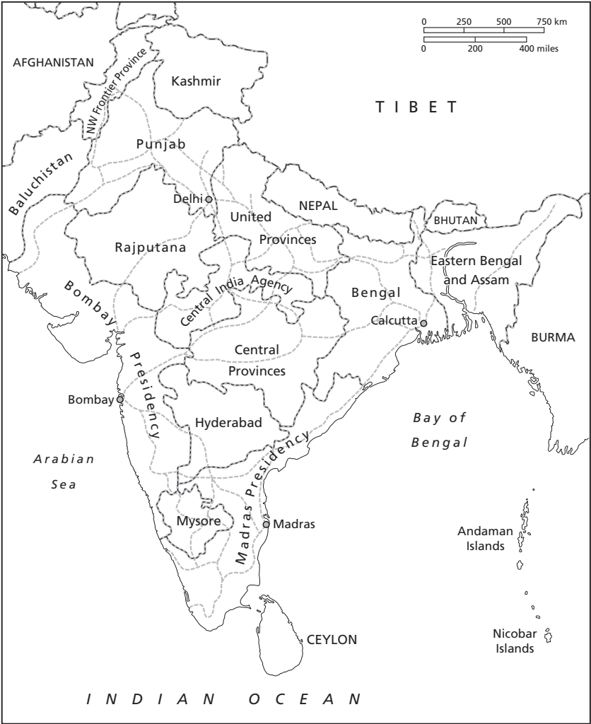
Map 1 British India 1909